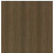
Walnut Flat Cut

Non-standard Species and Stains Over 100 species and cuts available.