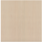
Maple Flat Cut