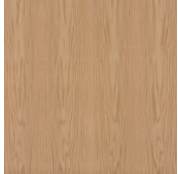
Red Oak Flat Cut